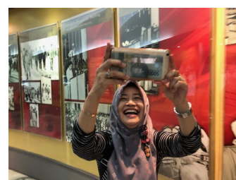
Bu Tias in Bandung